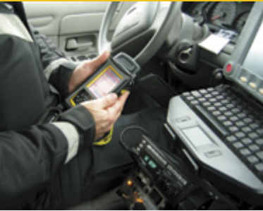
In creating a workflow for writing tickets electronically the goal was to automate as much of the process as possible.